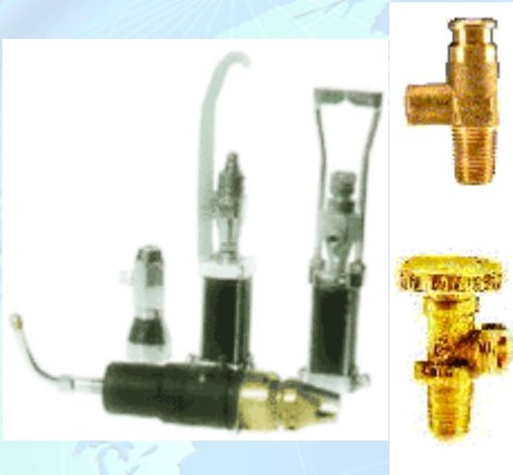
Filling heads produced in two types according to eylinders. One is with valve the other is faucet